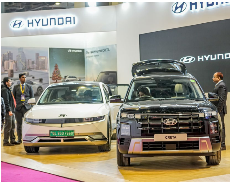
Hyundai Motor India showcasing the Ioniq 5 EV & their Safe Driving Initiative #BeTheBetterGuy