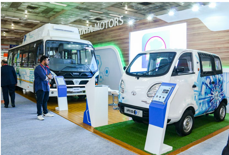
Tata Motors commercial vehicles showcasing different propulsion systems