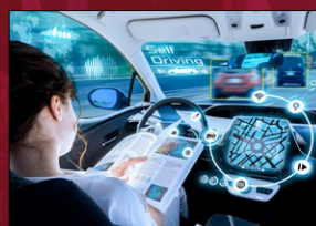
Intelligent Transport Systems