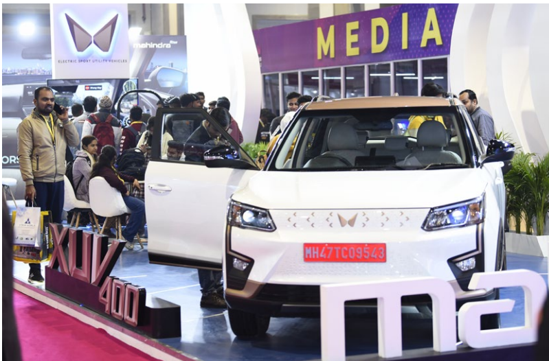
Mahindra showcasing a driving simulator & the XUV 400 EV