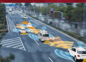
Automotive Communication & Connected Car Tech