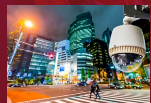
Mobility as Service