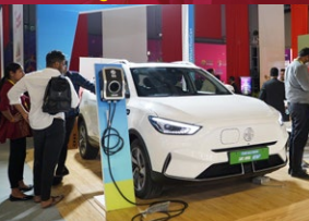
Vehicles & Advanced Automotive Tech