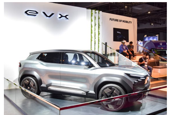
Maruti Suzuki showcasing the EVX concept and their digital showrooms