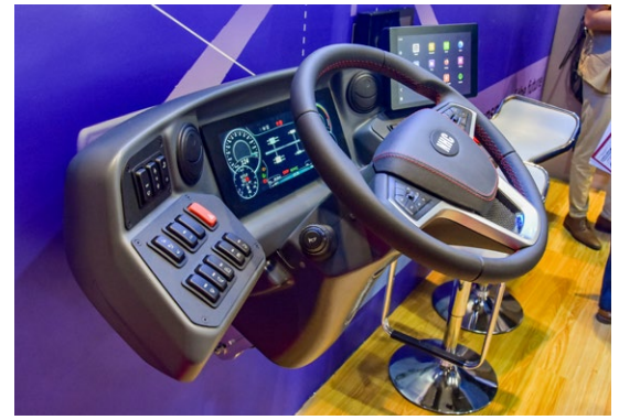
The Russia Pavilion showcasing public transport for the future