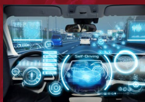
Advanced Computing & Integrated Displays